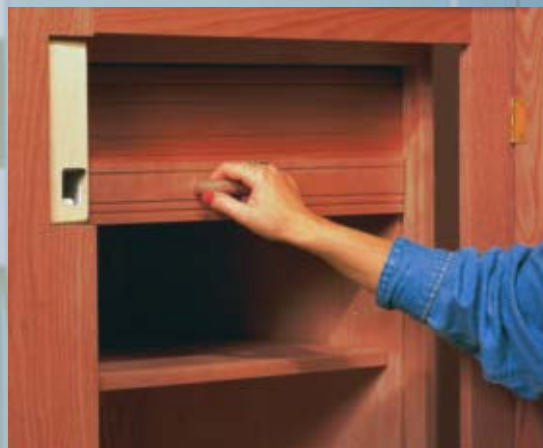
A roll top gate and a shelf are standard on all wood cars.

The Cable-Waiter™ offers convenience and flexibility, with economy. Available in wood, steel and stainless steel cars, this unit boasts up to a 100 lb. capacity. A roll top gate and a shelf are standard on all wood cars. Metal cars offer steel shelves, and a choice of bi-parting, or slide-up gates. Safety is assured with such standard equipment as a slack cable monitoring device, car safeties, top final limits and UL/cUL certified controllers. Designed to carry everything from delicate glassware to laundry, groceries, etc., this agile model is also comfortable in light-duty commercial applications, such as offices or medical clinics. With the availability of custom car sizes (metal cars only) Waupaca Elevator can build a Dumbwaiter to meet your requirements for design, as well as function.