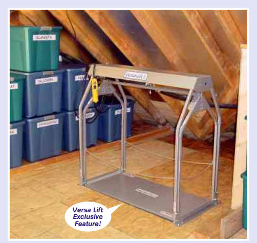
Versa Lift Level-Up™ system raises the platform flush to attic floor to unload cargo with no lifting.

(Common to All Models) 18" (for Auto-Close™ Feature) 8" per sec (8-ft in 12 sec) .093 steel - 1,000 lb break 110 volt AC, 60hz, 4.5 amp