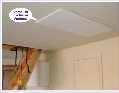
Versa Lift Auto-Close™ seals the ceiling opening and automatically adjusts for joist heights to 18"